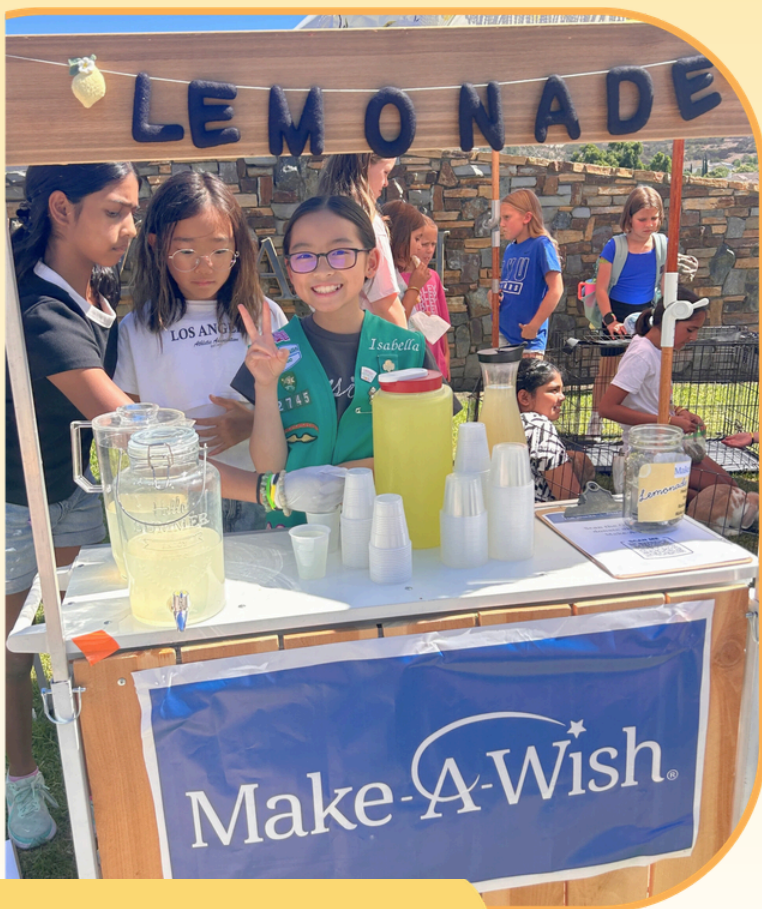
Girl Scout Troop 2745 handing out lemonade for donations!