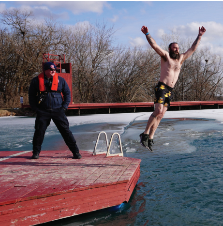
Dozens braved the chilly weather for the PENGUIN PLUNGE at SkyDive Chicago in January 2025. Teams and individuals raised just over $100,000 in this fun winter fundraiser.