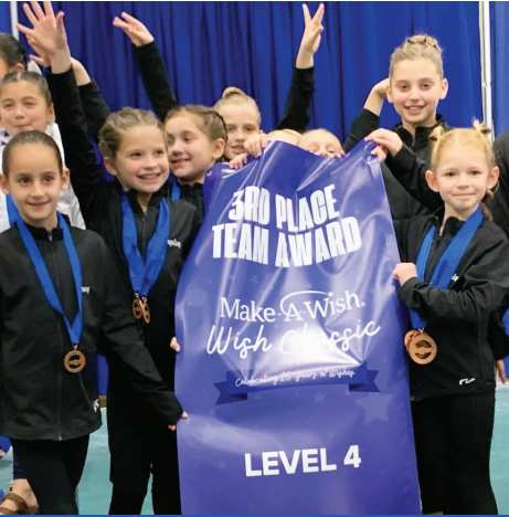
Created by Ultimate Gymnastics more than 25 years ago, the WISH CLASSIC hosted by Ultimate and Vernon Hills Gymnastics brings dozens of young athletes together. Held annually in north suburban Waukegan the event brings the Make-A-Wish mission into every aspect.

Community events benefiting Make-A-Wish Illinois play a crucial role in helping raise awareness and provide resources to grant wishes. Whether organized by community members or the chapter, their success relies on passionate supporters rallying their networks to grant wishes across Illinois.