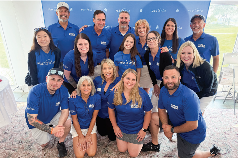
GOLFING FOR WISHES is a long-running community-organized annual fundraiser in Will county. This was a record breaking year for this event, raising more than $120,000 at the late summer event held at the Links of Carillon in Bolingbrook.