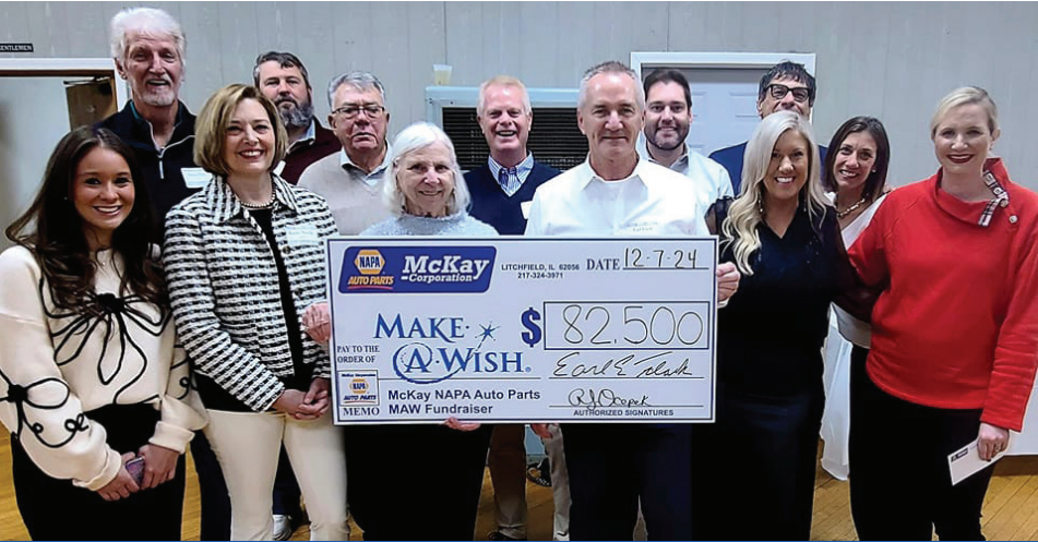
Through a series of events in western Illinois near their Litchfield headquarters, MCKAY NAPA AUTO PARTS continued their commitment to supporting children with critical illnesses through Make-A-Wish Illinois. Their donation of $82,500 this fiscal year brings their total giving to more than $897,000 since the partnership began in 2003.