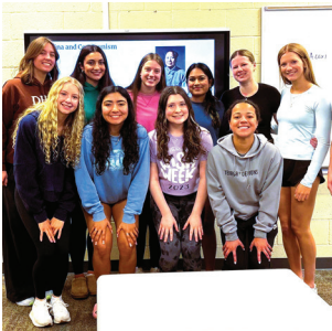
DUNLAP HIGH SCHOOL Youth Fundraising Award Kids for Wish Kids