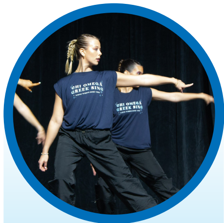
Chi Omega's at the University of Kentucky continue to shatter fundraising records and are paving the way for other Chi O chapters across the country.