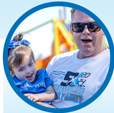
Amazon Air at CVG Airport is delivering hope to local children and families thanks to a local wish dad committed to paying it forward.