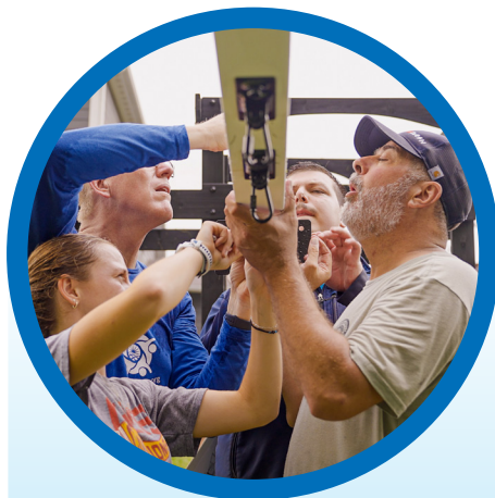
Corporate partners like MISO are instilling philanthropy into their culture and making work more purposeful for employees.