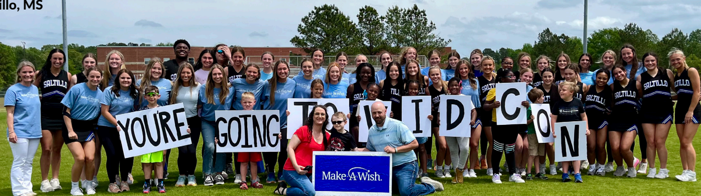
Salttillo High School Salttillo, MS