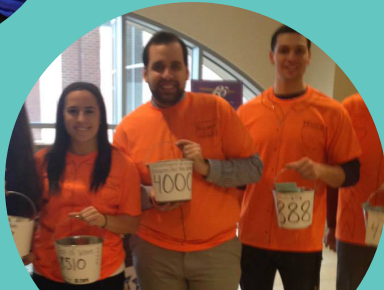
Scranton University Jail and Bail for Make-A-Wish