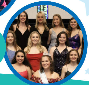
Sigma Tau's Miss Duquesne Pageant