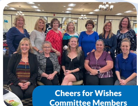
Cheers for Wishes Committee Members