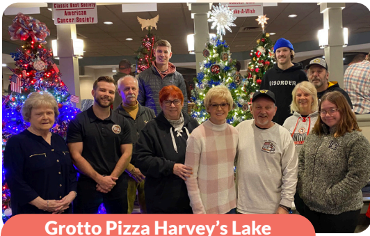
Grotto Pizza Harvey's Lake Parade of Trees