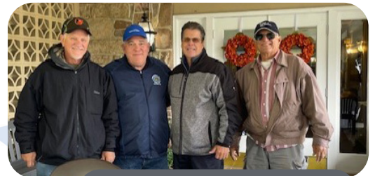
PA State Police Golf Outing