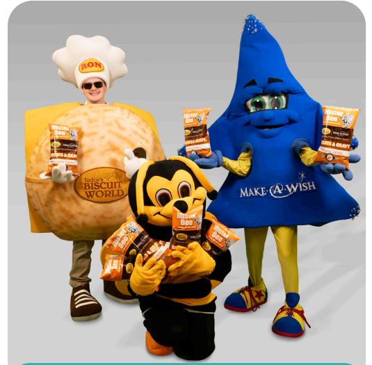
Mister Bee and Tudor's Biscuit World Collaboration Make-A-Wish Chips