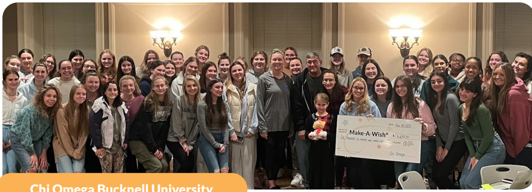
Chi Omega Bucknell University