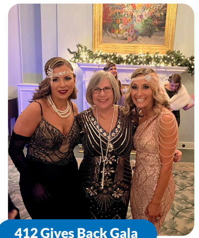
412 Gives Back Gala