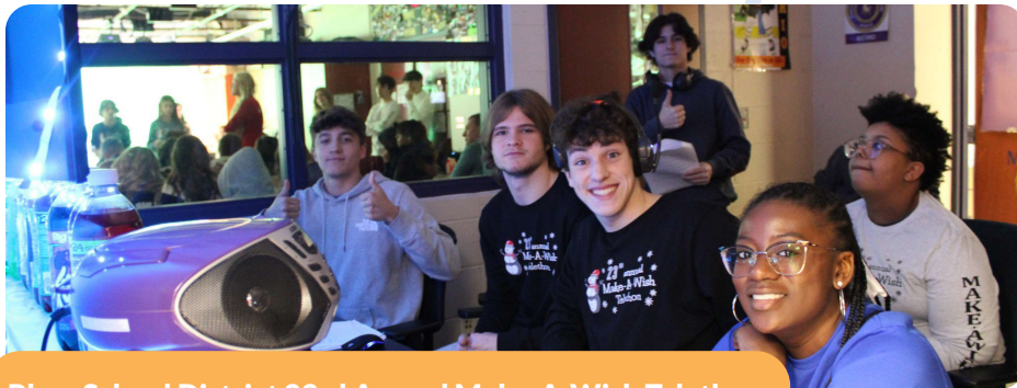
Plum School District 23rd Annual Make-A-Wish Telethon