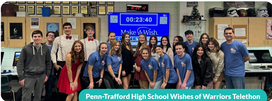
Penn-Trafford High School Wishes of Warriors Telethon