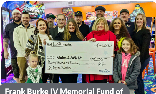
Frank Burke IV Memorial Fund of the Scranton Area Foundation