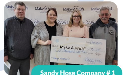
Sandy Hose Company # 1