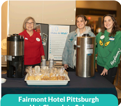
Fairmont Hotel Pittsburgh Hot Chocolate Sale