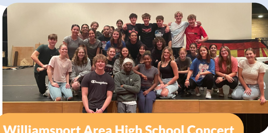
Williamsport Area High School Concert