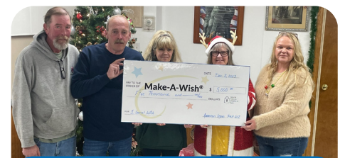
St. Thomas American Legion Post 612