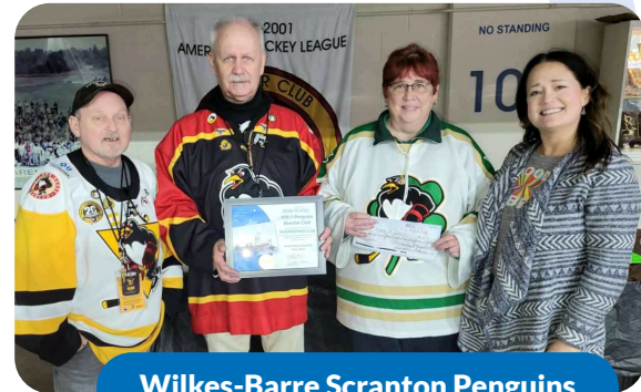
Wilkes-Barre Scranton Penguins Booster Club