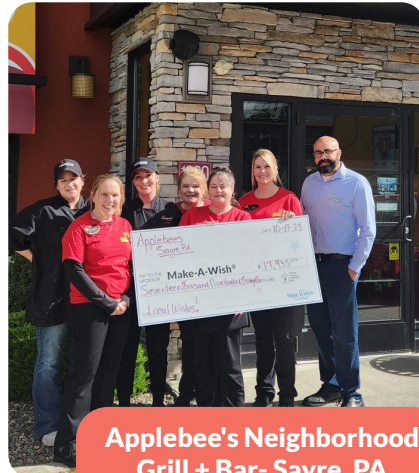
Applebee's Neighborhood Grill + Bar - Sayre, PA