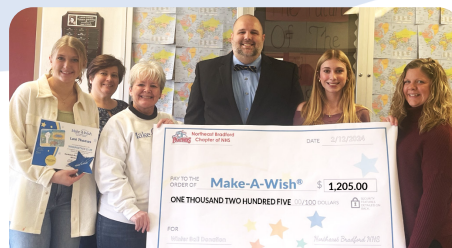
Northeast Bradford HS Chapter of NHS - Winter Ball