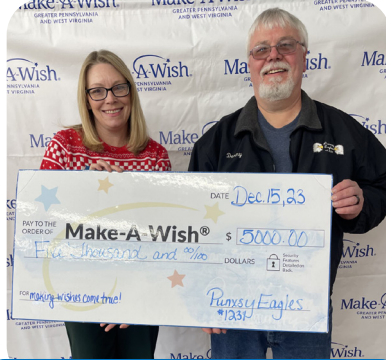
Fraternal Order of Eagles 1231