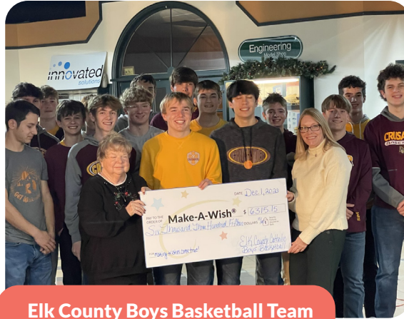
Elk County Boys Basketball Team