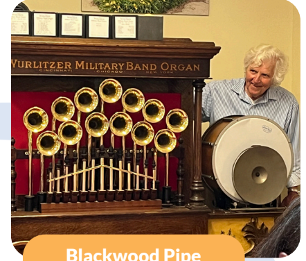
Blackwood Pipe Organ Concert