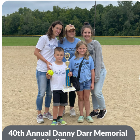
40th Annual Danny Darr Memorial Softball Tournament