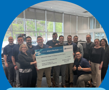
Subaru of Moon Township Moon Township, PA