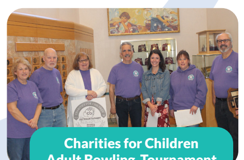
Charities for Children Adult Bowling Tournament