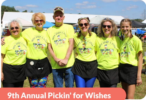
9th Annual Pickin' for Wishes