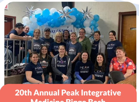
20th Annual Peak Integrative Medicine Bingo Bash