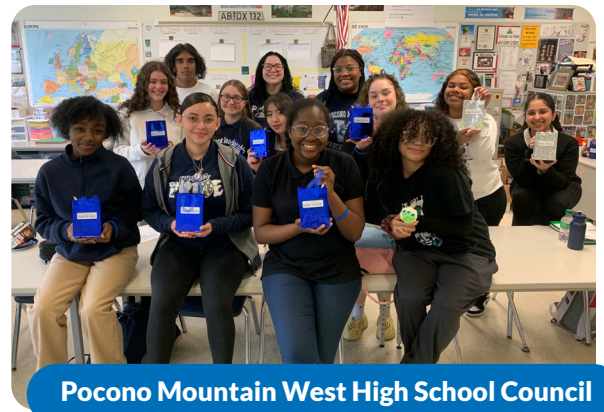
Pocono Mountain West High School Council