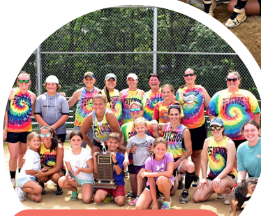
A Division Champs: Psychos