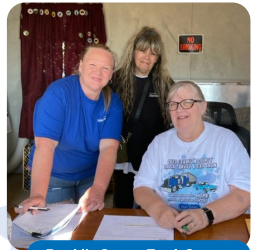
Franklin County Truck Convoy