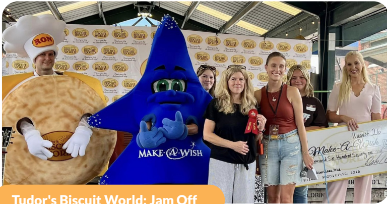
Tudor's Biscuit World: Jam Off