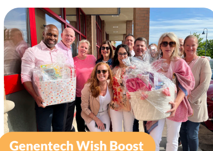
Genentech Wish Boost