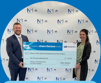
New Motors Subaru Erie, PA