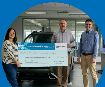
Fairway Subaru Hazle Township, PA