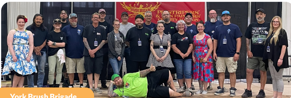
York Brush Brigade