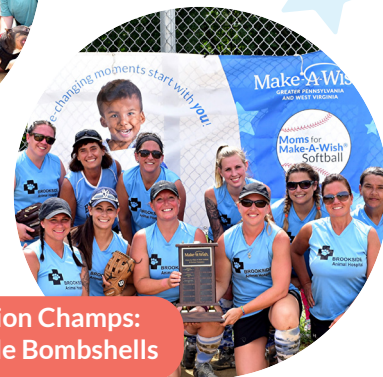
B Division Champs: Brookside Bombshells