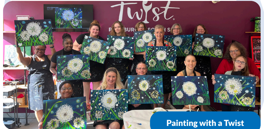
Painting with a Twist