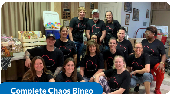
Complete Chaos Bingo