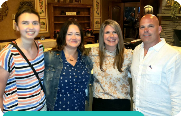
CJR Memorial Foundation