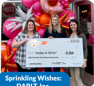
Sprinkling Wishes: DART, Inc.