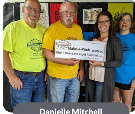
Danielle Mitchell Memorial Fund