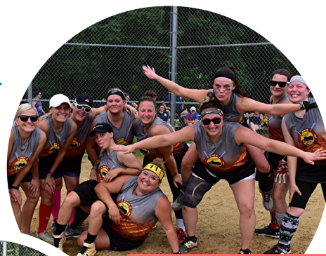
Highest Fundraising Team: New Minersville Firehouse Bikers

The event featured 12 softball teams, all working together to fund wishes in their community. Year-round, the teams fundraise for Make-A-Wish through a variety of events, such as bingo nights, dinners, raffles and so much more. The annual softball tournament celebrates the efforts of all the teams, while also sparking friendly competition to raise even more funds for wish kids. Since 1991, Moms for Make-A-Wish Softball has been a proud supporter of Make-A-Wish® Greater Pennsylvania and West Virginia.