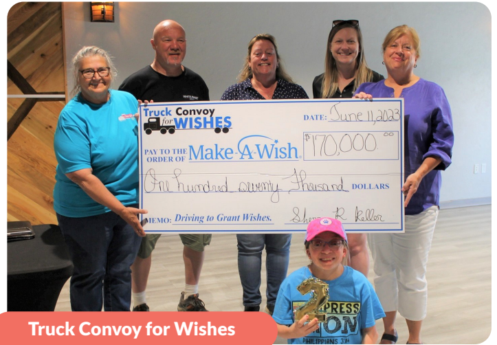
Truck Convoy for Wishes