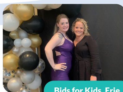
Bids for Kids, Erie