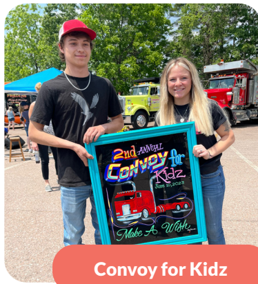
Convoy for Kidz