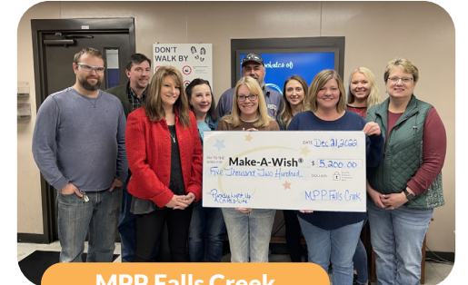
MPP Falls Creek