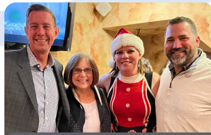
Coldwell Banker- North Huntingdon Celebrity Bartender Event