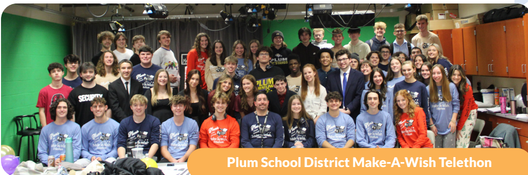
Plum School District Make-A-Wish Telethon