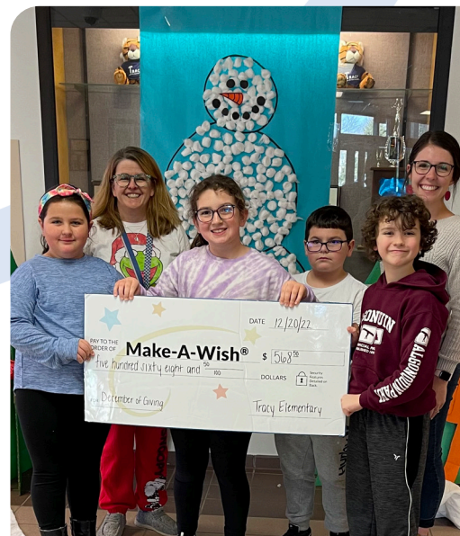
Tracy Elementary School