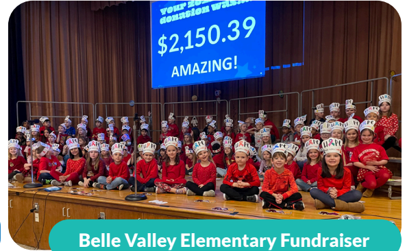
Belle Valley Elementary Fundraiser