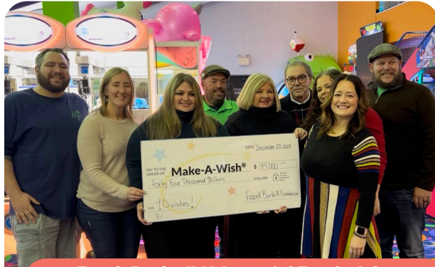
Frank Burke IV Memorial Fund of the Scranton Area Foundation