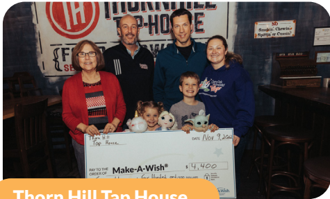
Thorn Hill Tap House