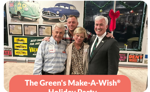
The Green's Make-A-Wish® Holiday Party