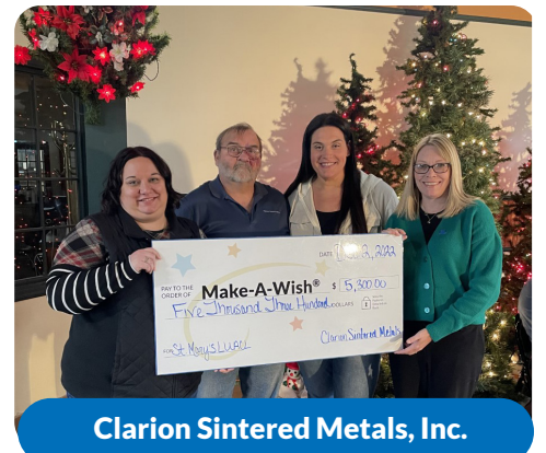
Clarion Sintered Metals, Inc.