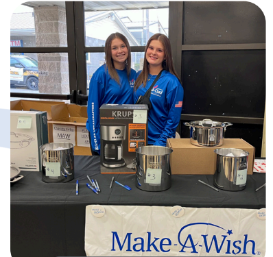
All-Clad Factory Sale