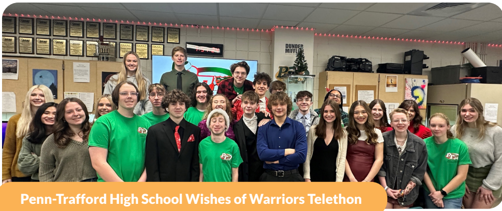
Penn-Trafford High School Wishes of Warriors Telethon