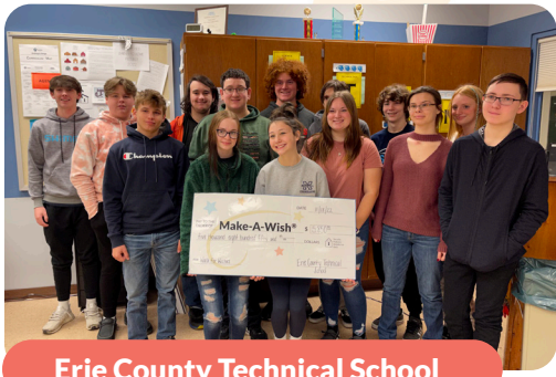
Erie County Technical School