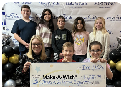
Oklahoma Elementary School