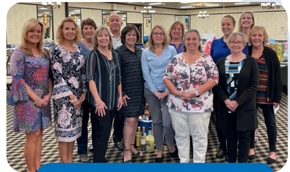
Cheers for Wishes Cheers for Wishes Committee