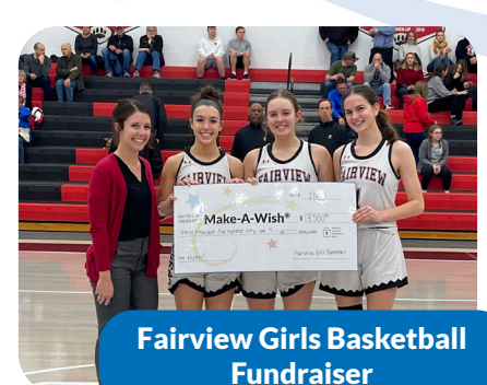
Fairview Girls Basketball Fundraiser