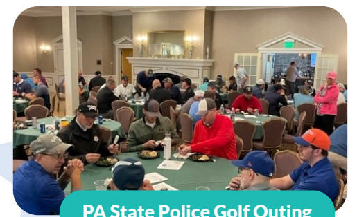
PA State Police Golf Outing