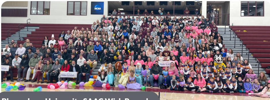
Bloomsburg University SAAC Wish Reveal