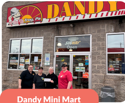
Dandy Mini Mart