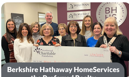
Berkshire Hathaway HomeServices the Preferred Realty