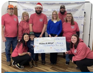
Donald J. Bennett Memorial Run