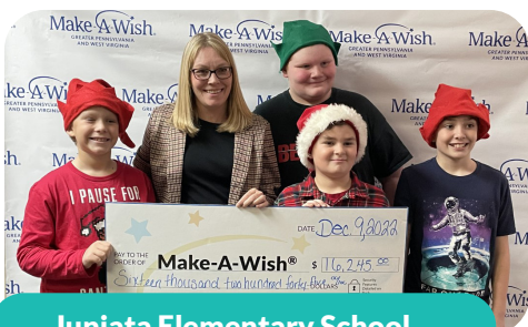
Juniata Elementary School