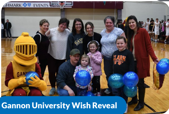
Gannon University Wish Reveal