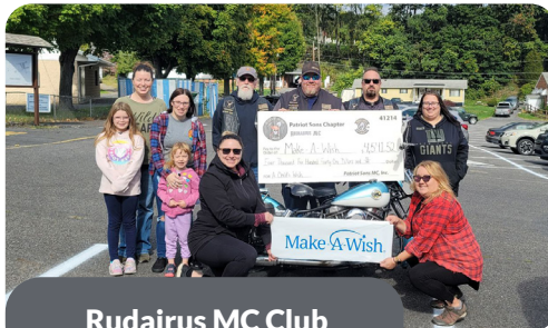
Rudairus MC Club