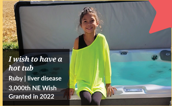
I wish to have a hot tub Ruby | liver disease 3,000th NE Wish Granted in 2022