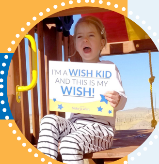
I wish to have a playset Vivian, 6 transplant