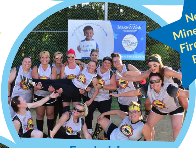
New Minersville Firehouse Bikers