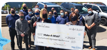
Moon Township Subaru-Moon Township, PA