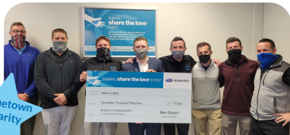
New Motors Subaru-Erie, PA

Check out these amazing life-changing donations made by your local Subaru dealerships in 2020.