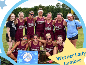
Werner Lady Lumber