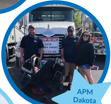
APM Dakota Jumper