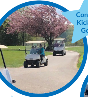
Convoy Kickoff Golf