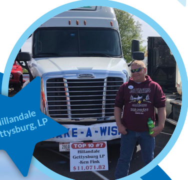
Hillandale Gettysburg, LP