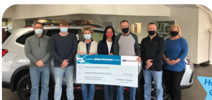
Lawrence Subaru-Hanover, PA

In addition to the Share the Love campaign, all four local dealerships also chose Make-A-Wish® Greater Pennsylvania and West Virginia as their Hometown Charity, raising additional funds on top of all their contributions from the campaign.