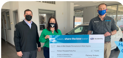
Fairway Subaru-Hazle Township, PA