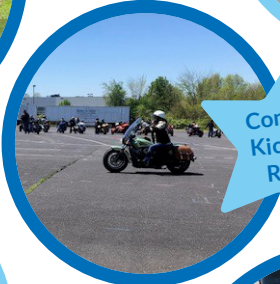
Convoy Kickoff Ride