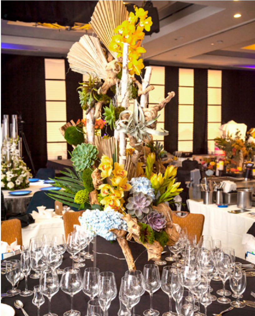
Table for Ten Orange Country Culinary Event features top chefs composing masterpiece signature dishes prepared tableside for 10 guests.

At each table, chefs create unique awe-inspiring table designs, cuisine fit for royalty, exquisite wines perfectly paired for each course and a five star "white glove" service.