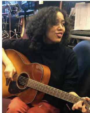
“I wish to have an acoustic guitar.”