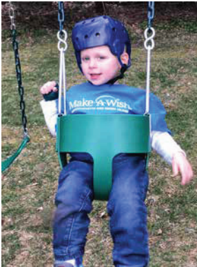
“I wish to have a playset.”

Springfield Country Club, West Springfield, Massachusetts