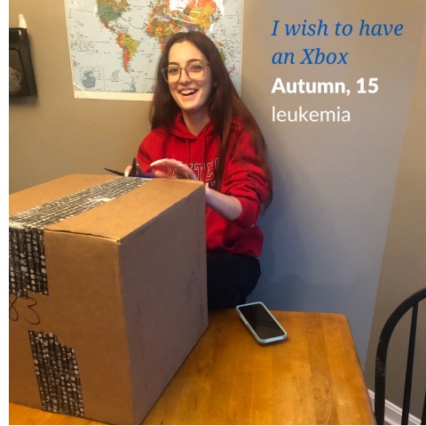
I wish to have an Xbox Autumn, 15 leukemia

As 2020 comes to a close, we want to wish you a happy holiday season and a joyful new year! Stay tuned for many exciting updates from us in 2021.