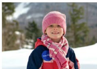
Wish kid shot