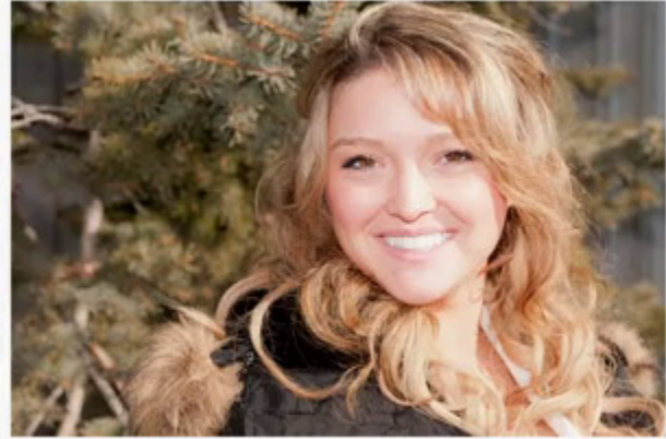
Outdoors with flash

4. Always make sure the light (sunlight or indoor light) is in front of the person you're taking a photo of. Taking a photo with the light behind them will make them look dark.