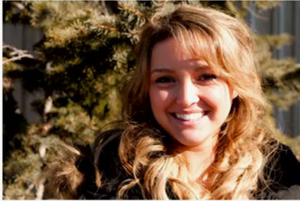
Outdoors without flash

3. Don't be afraid to use flash if the lighting isn't great – shadows can ruin a great shot. When in doubt, try one photo with flash and one without to see what works best!