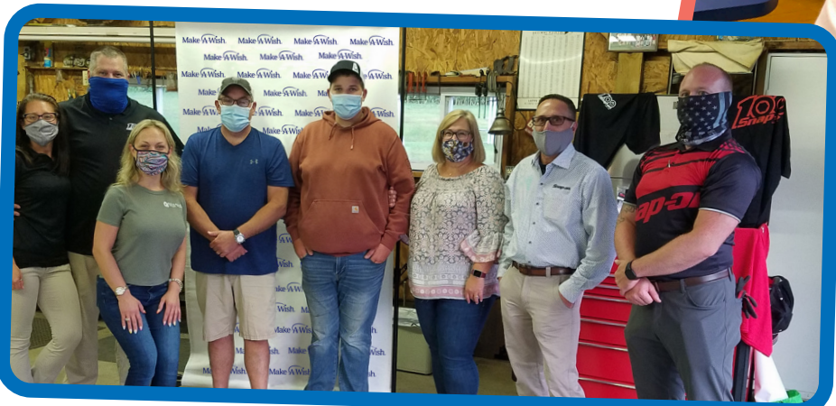
I wish to go camping at Jelly Stone Campground Emmy, 3 ↓ cardiac condition Kittanning, PA