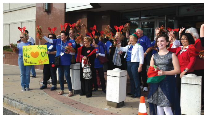
Volunteers gather to cheer for arriving wish kids at a special holiday campaign event

The longest running event to benefit our chapter, the 31st Annual "Tee Off for the Kids" Golf Outing was held this past summer. Since 1985, over $1,000,000 has been raised!