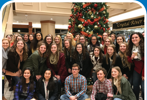
North Hills High School students at the Fifth Avenue Place in Downtown Pittsburgh showing their support. Since 1994, students from North Hills High School have raised nearly $100,000 for Make-A-Wish.