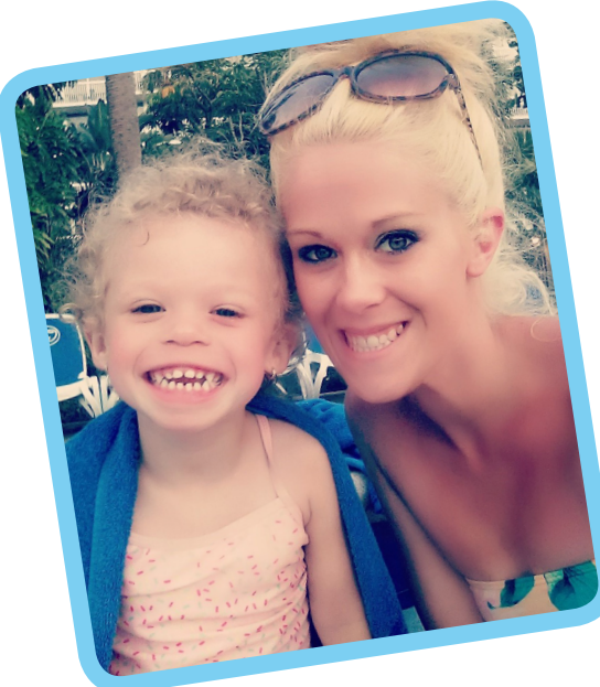
I wish to go to Longboat Key, FL Delilah, 3 ← heart condition Weirton, WV