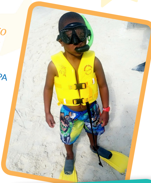
I wish to go snorkeling Jersiyah, 6 → liver disorder Chambersburg, PA