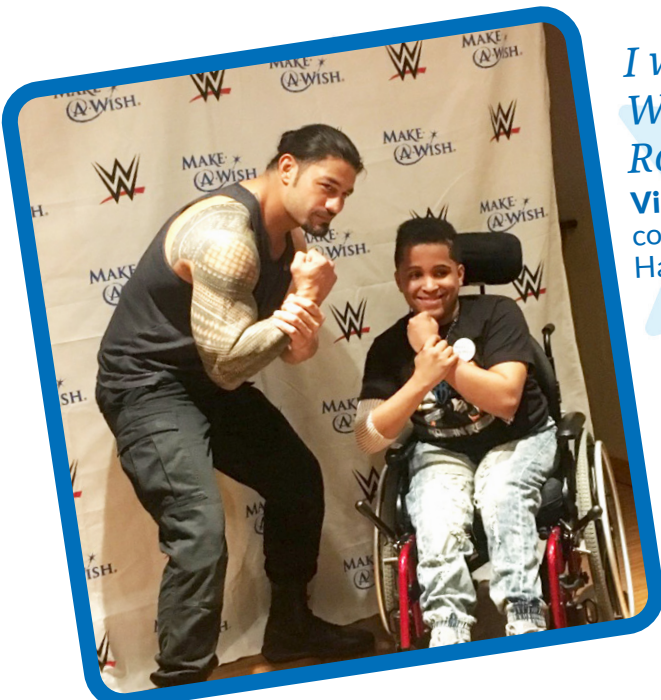
I wish to meet WWE Superstar Roman Reigns Vianny, 17 ← congenital skeletal disorder Hazleton, PA