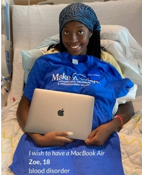
I wish to have a MacBook Air Zoe, 18 blood disorder

Don't forget that we need your continued support to grant wishes like Zoe's. Please consider a donation today.