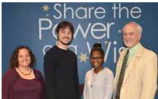
SUNY Albany's entrepreneur class raised funds for wishes.