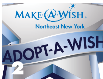
2 Adopt-A-Wish campaign kickoff