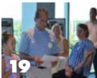
19 Celebration of Hope, Strength and Joy