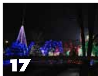
17 A shining tradition – Kristy Pollak Christmas Lights