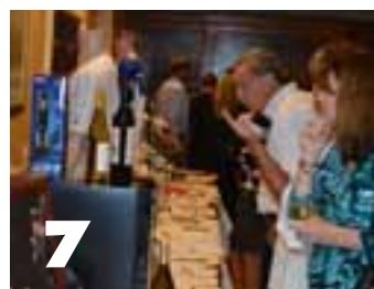
7 Cheers for Wishes