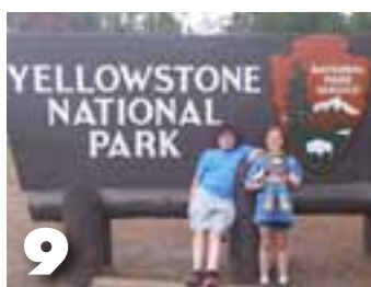
9 Wishes Remembered