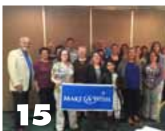
15 Volunteers Honored