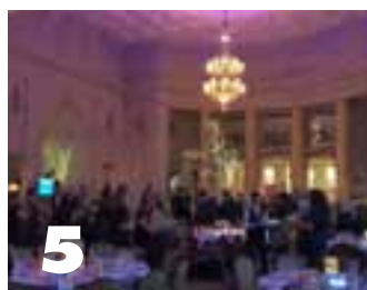
5 Gala 2017 date set