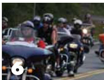
6 Wack's Ride