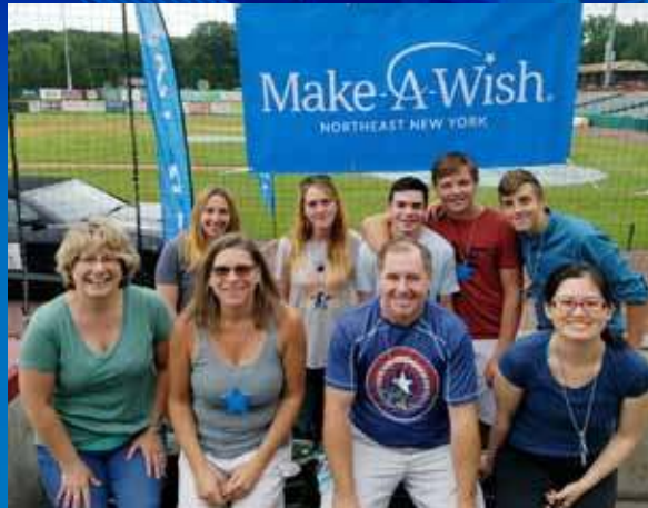
Appolo Hills Walk For Wishes Team

Participating at the Walk was a first for most of us and unbelievably uplifting to see the amount of support and positivity of everyone involved in this awesome event! Even as it started raining at the beginning of the Walk, many participants carried onward for this amazing cause. The Walk was a great experience for all of us, and we can't wait to continue our fundraising efforts as well as participate in the Walk for many years to come!