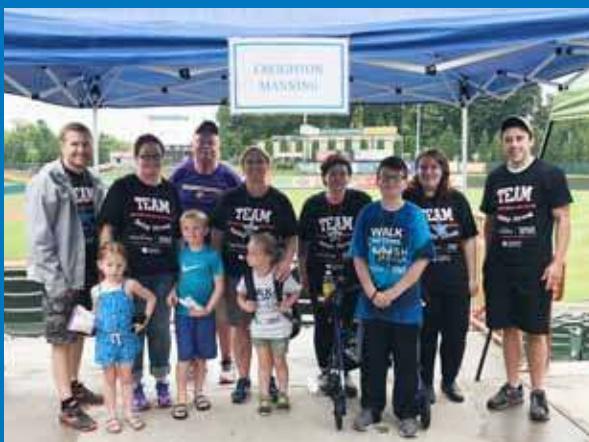
Creighton Manning Walk For Wishes Team