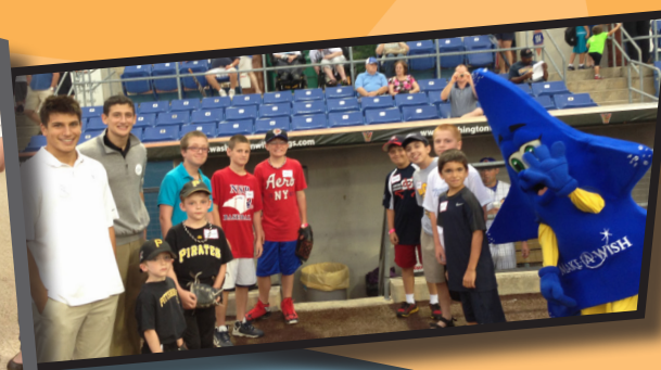
Baseball Night Senior Project